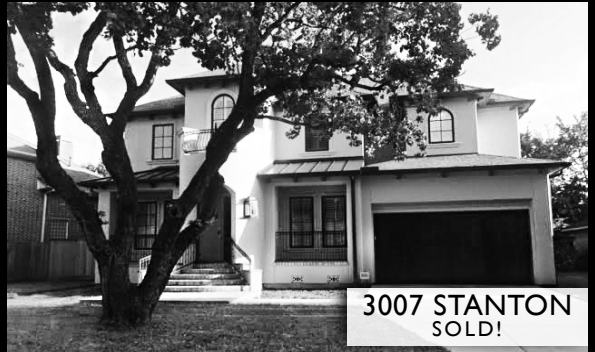
3007 STANTON SOLD!