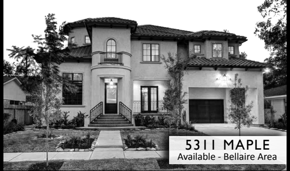
5311 MAPLE Available - Bellaire Area