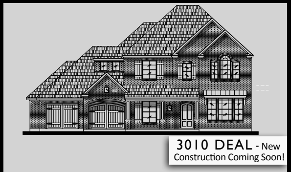
3010 DEAL - New Construction Coming Soon!

NOW IS STILL A GREAT TIME TO BUY OR SELL! CALL FOR A FREE MARKET ANALYSIS OF YOUR HOME!