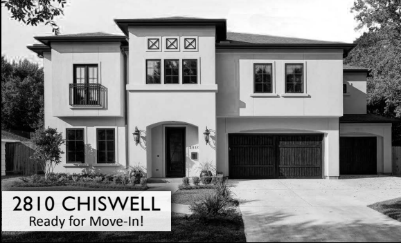
2810 CHISWELL Ready for Move-In!