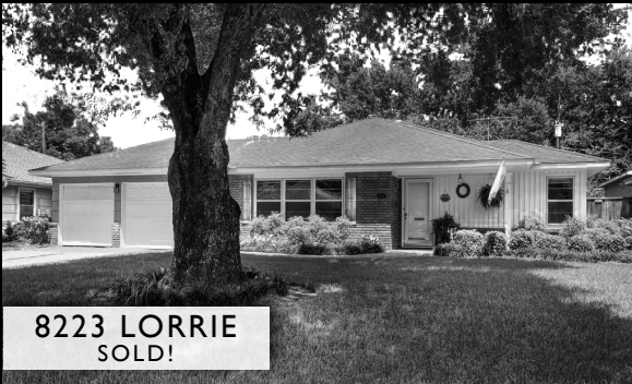
8223 LORRIE SOLD!