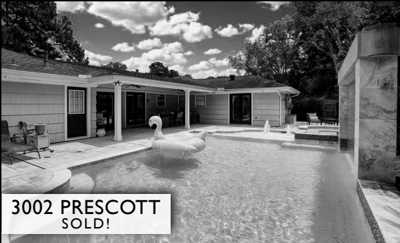
3002 PRESCOTT SOLD!