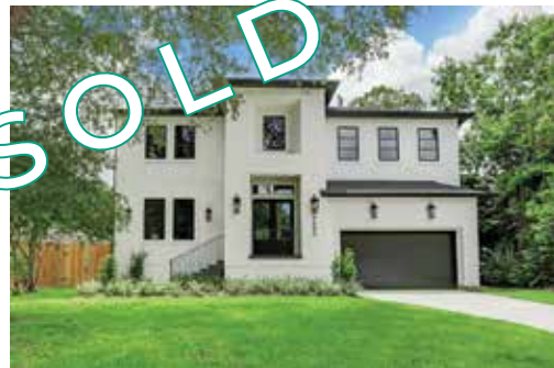
Prescott Street 5 Bedrooms, 4 Baths 4,279 SqFt