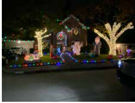
2nd Place – 3018 Broadmead