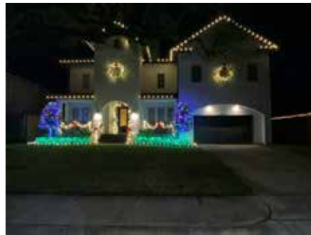
Most Traditional – 3411 Broadmead