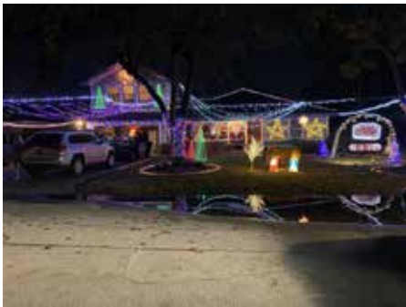
Most Creative – 2811 Prescott