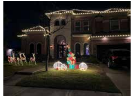
Best Color Scheme – 3115 Linkwood

The Knollwood Village Social Committee is gearing up for 2021 and typically would be planning to host several events throughout the year. However, due to the pandemic most of it is on hold. If you have any safe / fun activities to do with your neighbors and help build our community in our neighborhood, please reach out. If you have ideas, questions, or want to volunteer for the social committee, please email social@knollwoodvillage.org