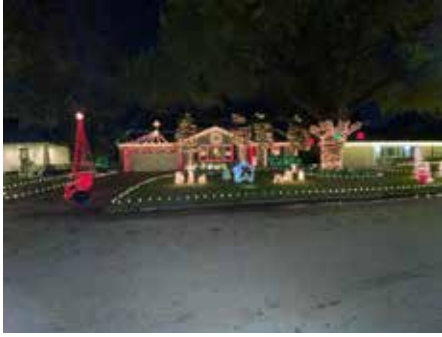
1st Place – 3018 Linkwood