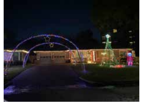
3rd Place – 8227 Lorrie