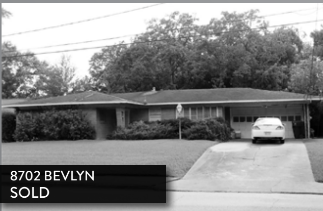
8702 BEVLYN SOLD