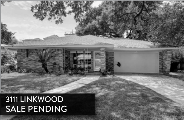
3111 LINKWOOD SALE PENDING