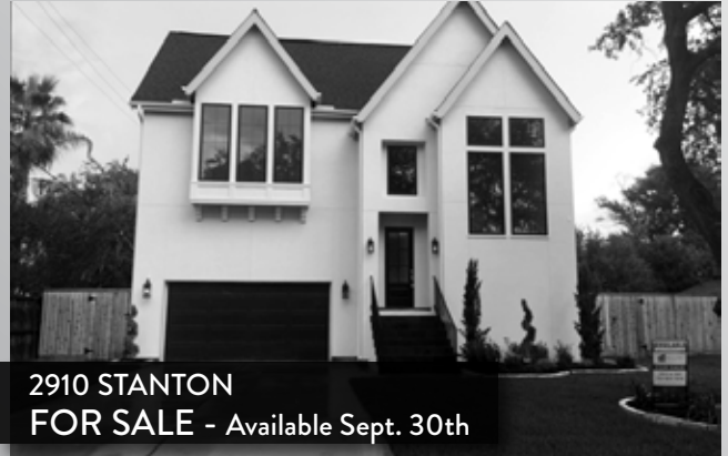
2910 STANTON FOR SALE - Available Sept. 30th