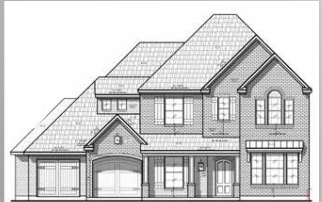
3010 DEAL ST. NEW CONSTRUCTION - COMING SOON