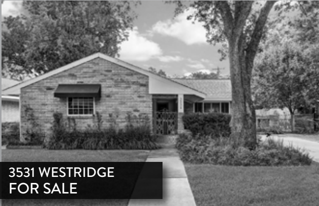
3531 WESTRIDGE FOR SALE